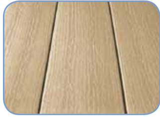
Dream® Deck w/Vy-Grain™