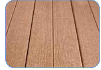
Dream® Composite Deck