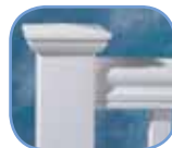
New England Cap