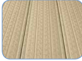
Dream® Deck Classic